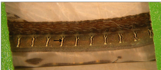
Fig. 3. A male pipefish with iridescent stripes 19 days after removal from treated water. The arrow indicates the iridescent stripes, and the space between the green bars on either end of the photograph is 1.5 cm. This image shows that the feminization of males by EE2 persists after the males are moved to clean water. These traits persist at least several weeks, as they were still present when the males were sacrificed at the end of the experiment (2–3 weeks post-exposure). They may persist much longer, but this question was beyond the scope of our study.

While our study shows that exposure to EE2 can impact mating dynamics, the effects of exposure at the population level is an equally important issue. The exact effects are difficult to predict and would be worthy subjects of future research. On the one hand, modest levels of